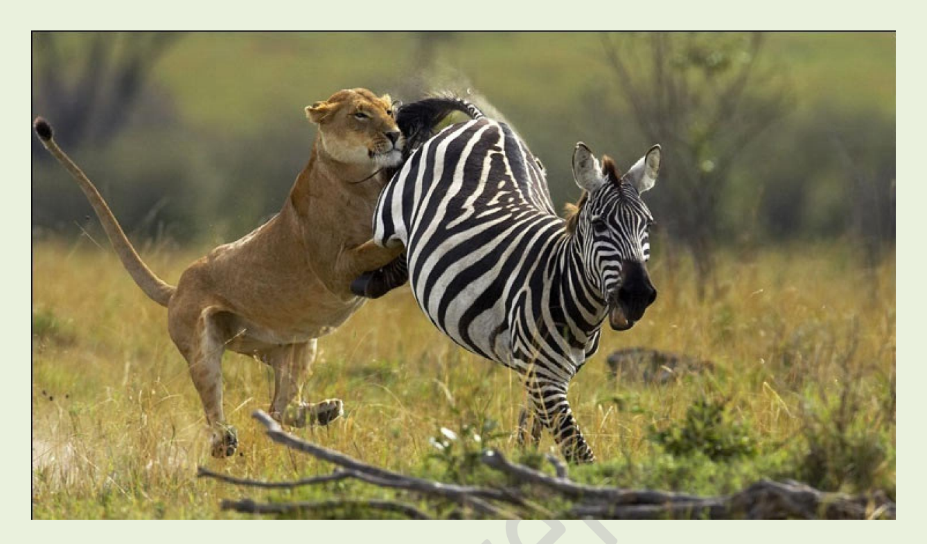
DAY 3: MASAI MARA – ISEBANIA BORDER- SERENGETI NATIONAL PARK

Rise up early for breakfast, check out and depart Masai Mara Game Reserve for Serengeti. Drives past villages and towns towards Isebania border where our driver/guide will arrange the necessary documentation for your entry into Tanzania. Please note that there shall be a switch of vehicles and guides according to the country you shall be entering; this is seamless and should not distress you. Arrive at Serengeti national park and enjoy game viewing on your way to the lodge. Serengeti National Park is arguably one of the best wildlife sanctuaries in the world and is probably one of the reasons you came to Africa. Charge your camera, grab your binoculars, and set out for an afternoon to remember as you set out accompanied by an experienced tracker-guide into the seamlessly never-ending expanses of the Serengeti.