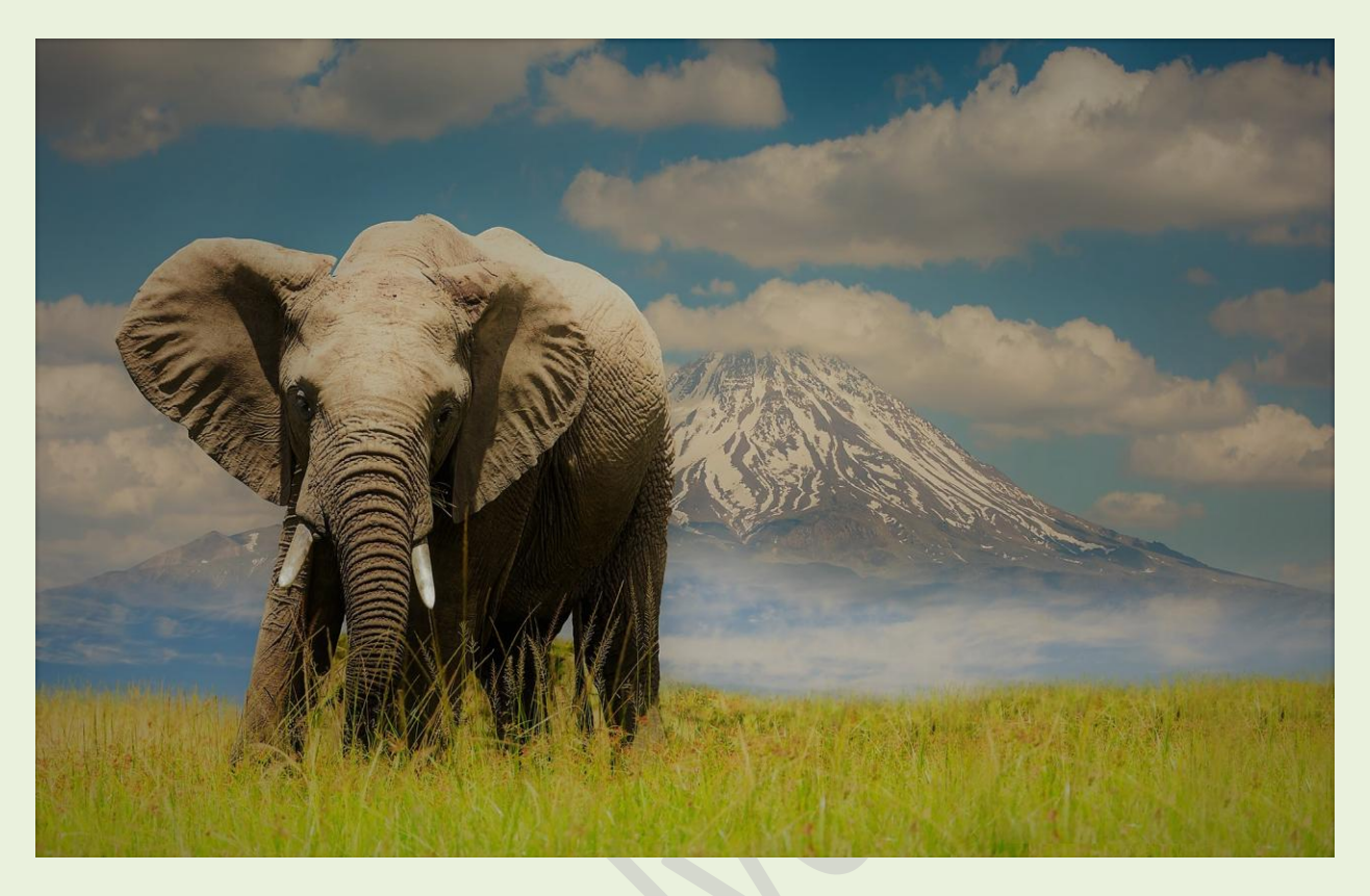
DAY 7: NGORONGORO – ARUSHA - AMBOSELI NATIONAL PARK

Rise up early for breakfast, check out and depart Ngorongoro for Amboseli National Park. Drives past villages and towns towards Namanga border where our driver/guide will arrange the necessary documentation for your entry into Kenya. Please note that there shall be a switch of vehicles and guides according to the country you shall be entering. We will arrive at Kibo Safari Camp with enough time to settle in before lunch with a little time to relax before we head out for our evening game drive between 1600hrs to 1830hrs. We explore one of Kenya's most popular tourist parks for the opportunity to see animals against the backdrop of Africa's highest mountain- Mount Kilimanjaro. The elephants are the kings of the park, no doubt, they are fond of the swamp areas in the park, where they share the cool waters with the hippos and hide beneath the papyrus.